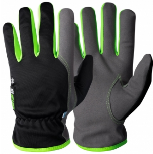
Assembly Winter gloves EX®